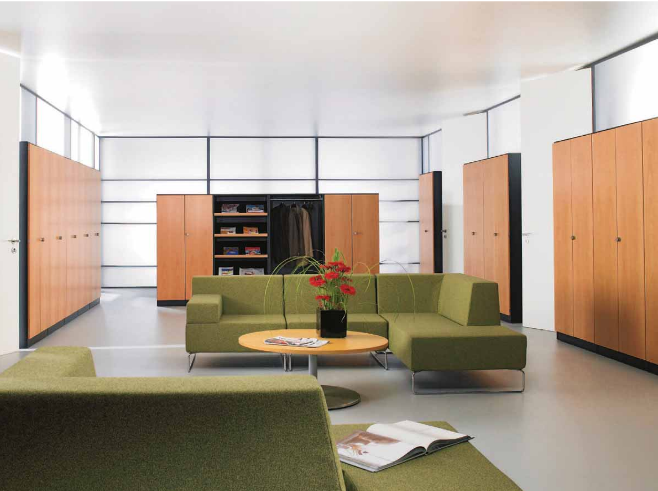
Series Lounge | RondoLounge-ST | Series 800