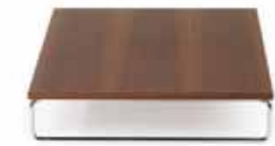
Series Lounge Occasional Table