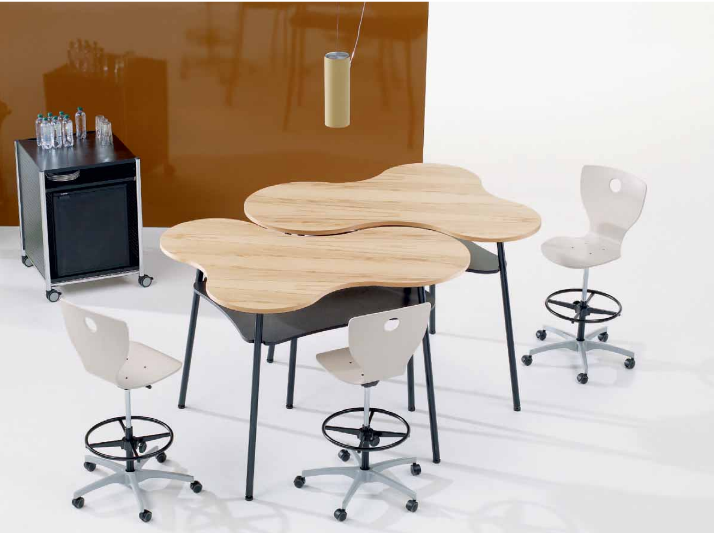
Network | PantoMove-VF Plus | Series 600 Catering Module