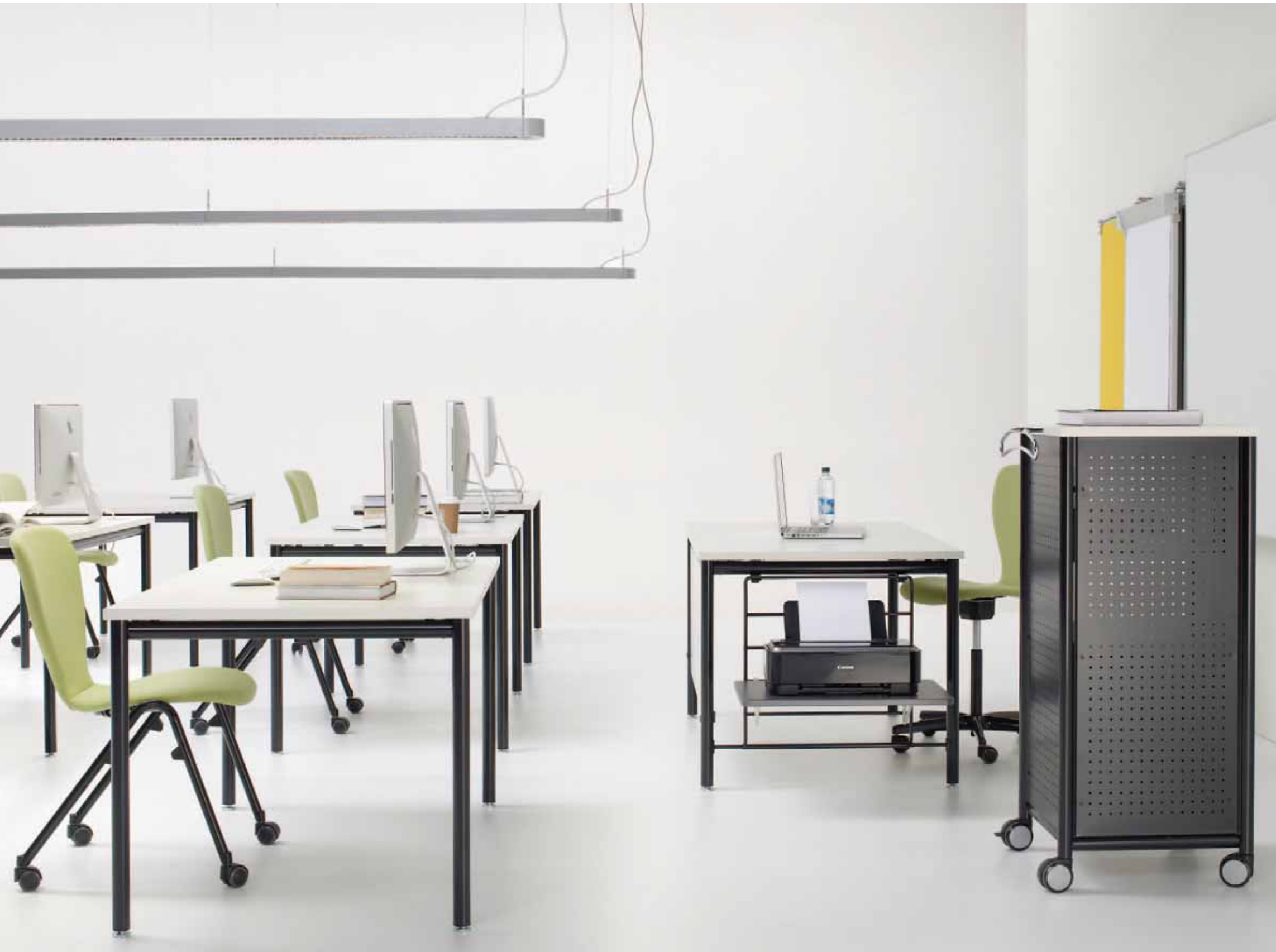
Network | Compass-VF Upholstered | Series 600 Stand-at Module