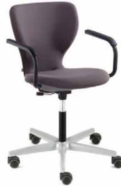
PantoMove-Soft with Armrests (31514)