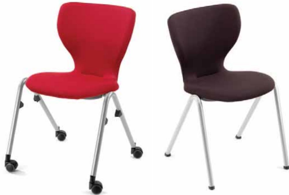
Compass-Soft with Castors