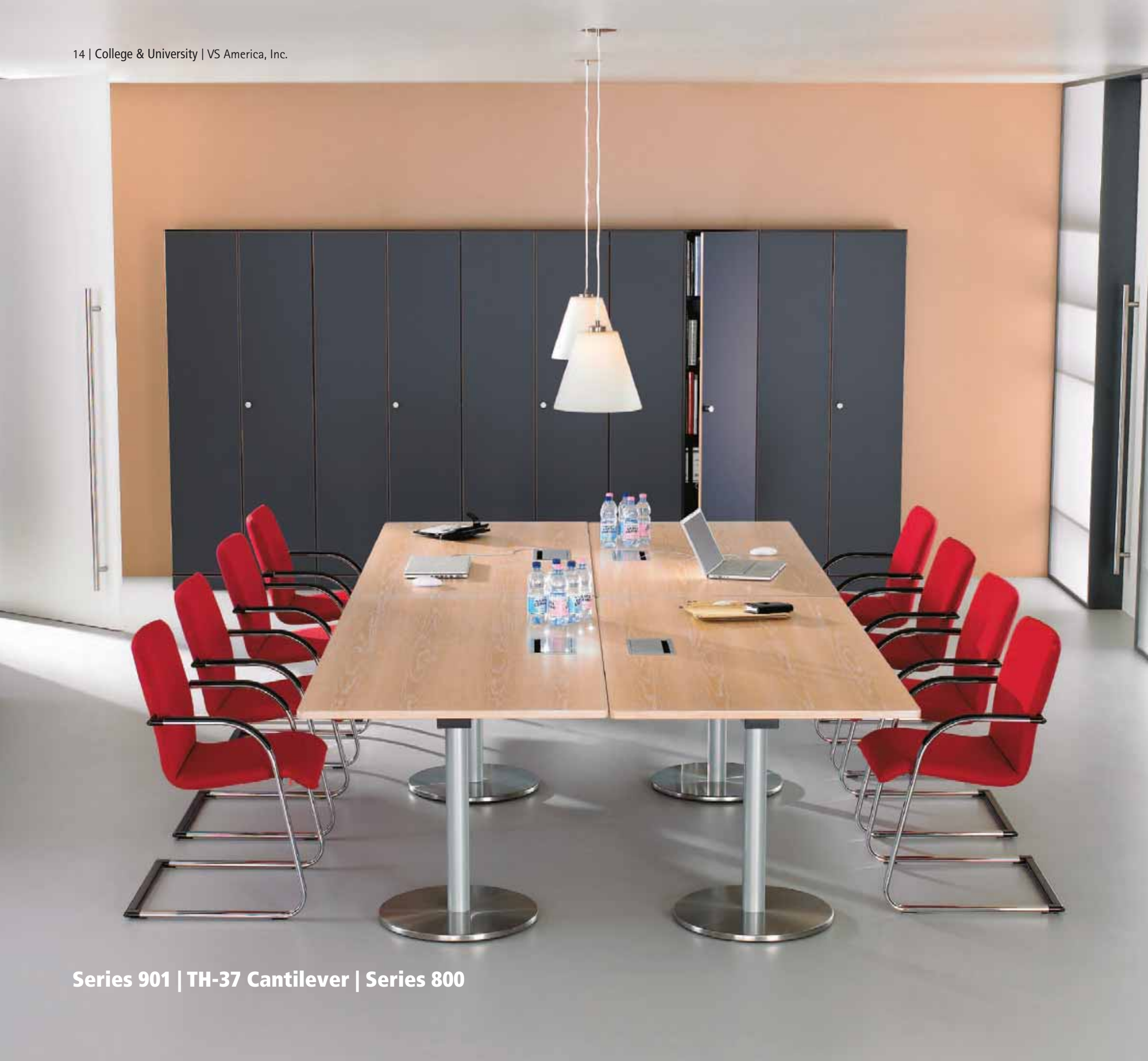
Series 901 | TH-37 Cantilever | Series 800