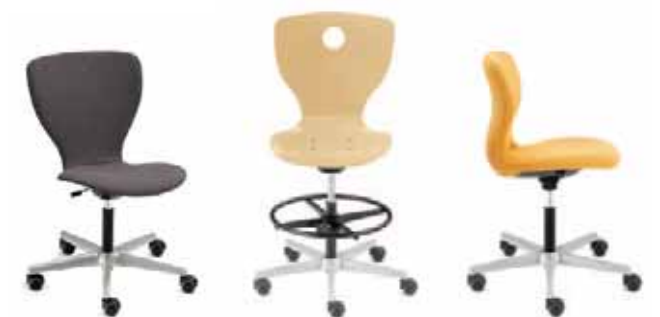
PantoMove-VF PantoMove-VF Plus PantoMove-Soft

Single table. Table tops: rectangular, wedge, half-circular, trapezoidal and angular shapes Table heights: fixed heights, stepless or step-height adjustment Options: glides/castors, basic and add-on tables + hanging leaves, modesty panels, wire management, grommets